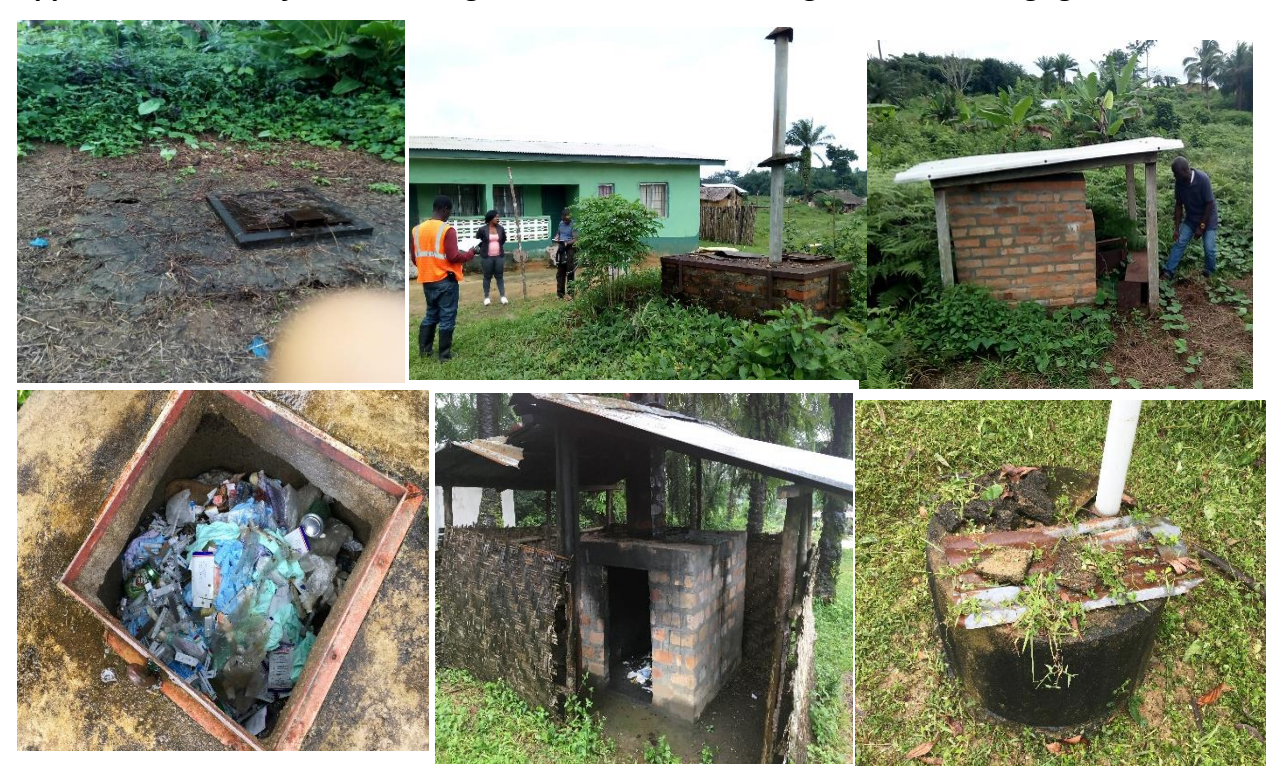
Appendix 6: Views of waste management assessment during stakeholder engagement