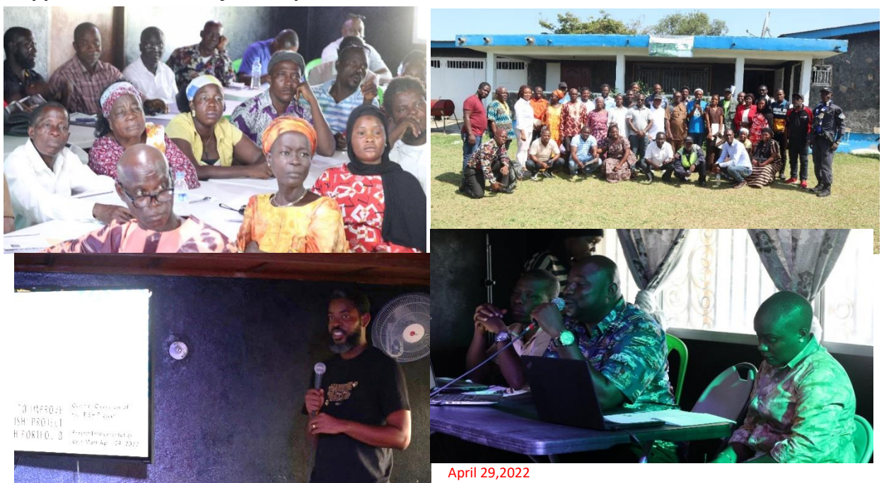
Appendix 8: Photos of Participants